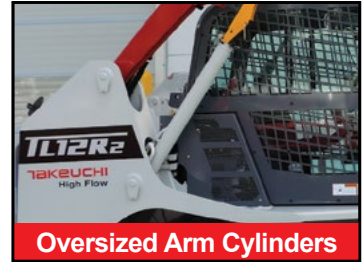
Oversized Arm Cylinders

The TL12R-2 features a radial arm loader arrangement, and demonstrates Takeuchi's continued commitment to product improvement and innovation. It features a completely redesigned operator's station with a 5.7" color multi-information display excellent feature set, and updated rocker switches that control a wide range of machine functions.