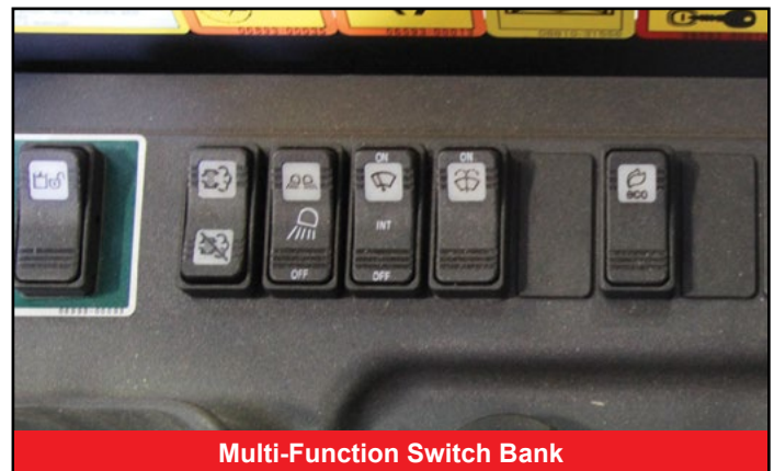
Multi-Function Switch Bank