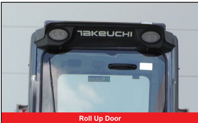
Roll Up Door