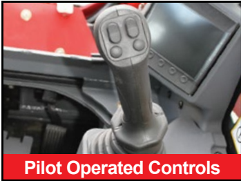
Pilot Operated Controls