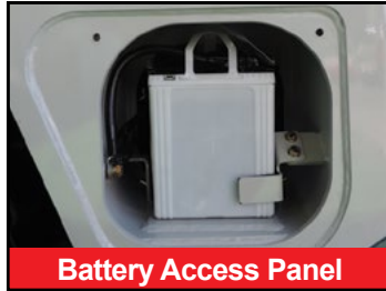
Battery Access Panel