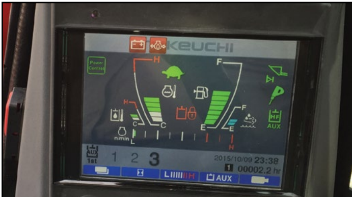
5.7" Color Display