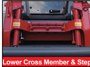
Lower Cross Member & Step