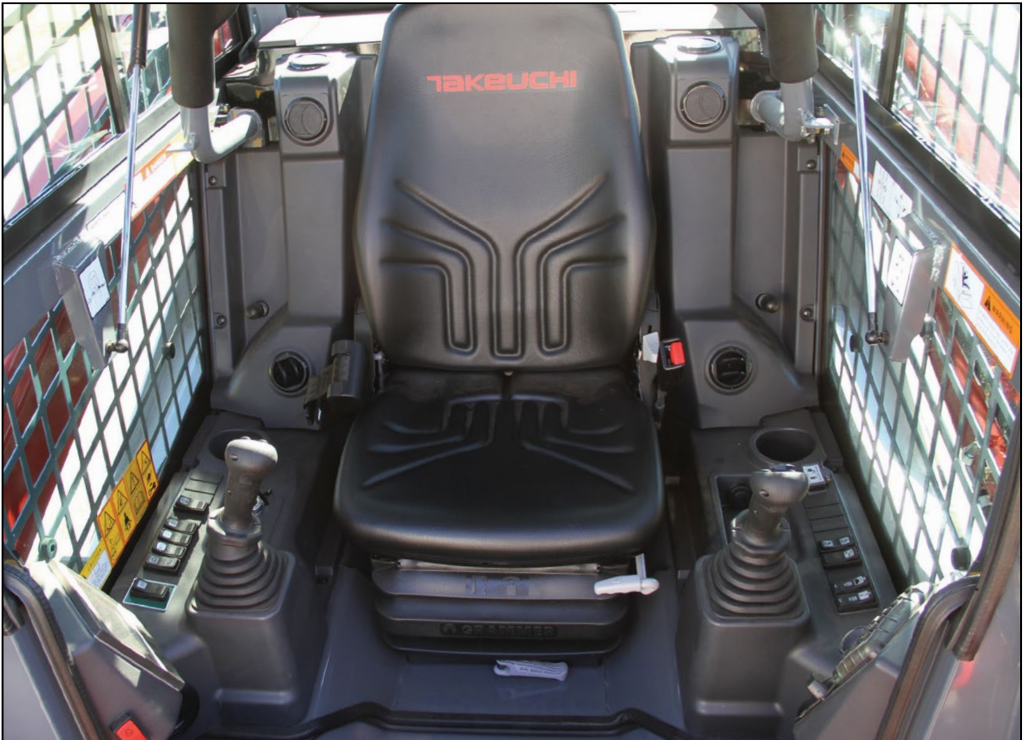
Spacious operator's station with easy to reach controls and switches.

An updated undercarriage with a wide block quiet ride track system provides better flotation, improved ride quality, and a reduction in noise and vibration. A powerful, 81.8 kW engine meets the latest EU Stage V / EPA Tier 4 emissions standards while delivering outstanding power and torque for impressive performance in the most demanding applications