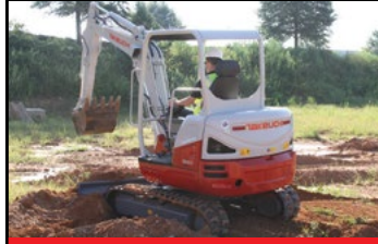
All Steel Construction