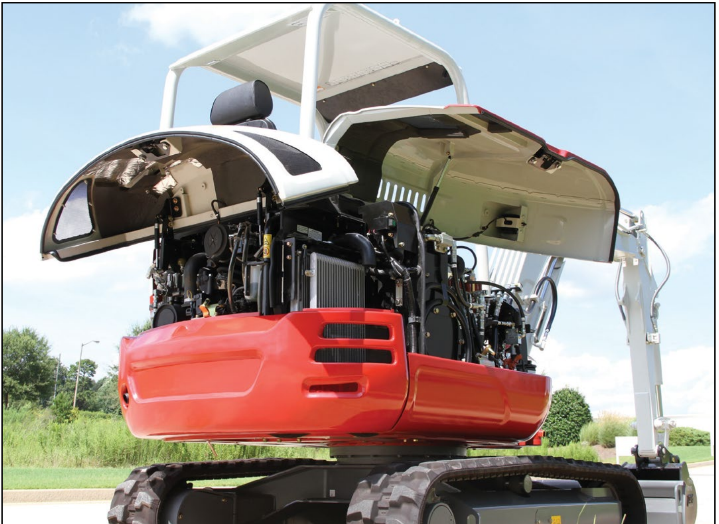
Lockable service hoods lift overhead for outstanding maintenance access.

emission standards compliant engine that has no DPF for low maintenance operation. Additional features include an automatic fuel bleed system, double element air filters (optional), large wrap around counterweight, and exceptional serviceability due to the engine and side hood that open overhead for greater convenience. The operator is protected by ROPS/TOPS/OPG (TOP Guard, Level I) cab or canopy for greater peace of mind and comfort.