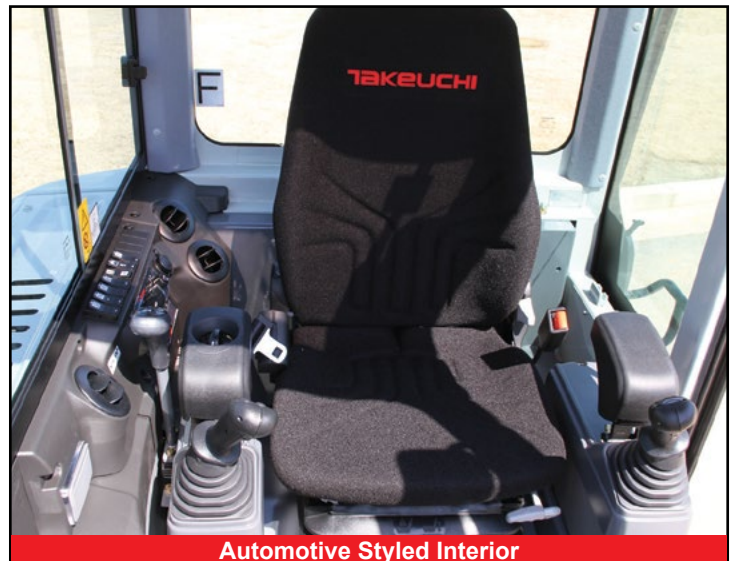
Automotive Styled Interior

*Functions may not be available in all countries, so please consult your Takeuchi dealer for details.