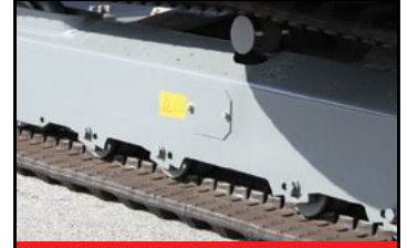
Triple Flanged Track Rollers

Ease of transport and an excellent working range make the TB235-2 a great choice for owner-operators, rental companies, utilities and general contractors. The TB235-2 has all steel construction, a spacious operator station available with air conditioned cab (optional), an automotive styled interior, outstanding multi-function operation, LED light package (optional) and cushioned boom and swing cylinders for enhanced performance comfort and durability. The TB235-2 has the latest